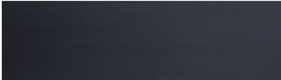
MATTE BLACK BRONZE

STANDARD FINISHES AVAILABLE CONTACT INFO@HILLIARDLAMPS.COM FOR CUSTOM REQUESTS