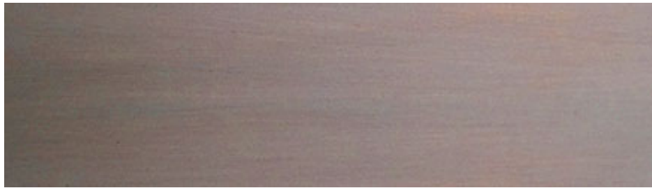
BRUSHED ANTIQUE BRONZE