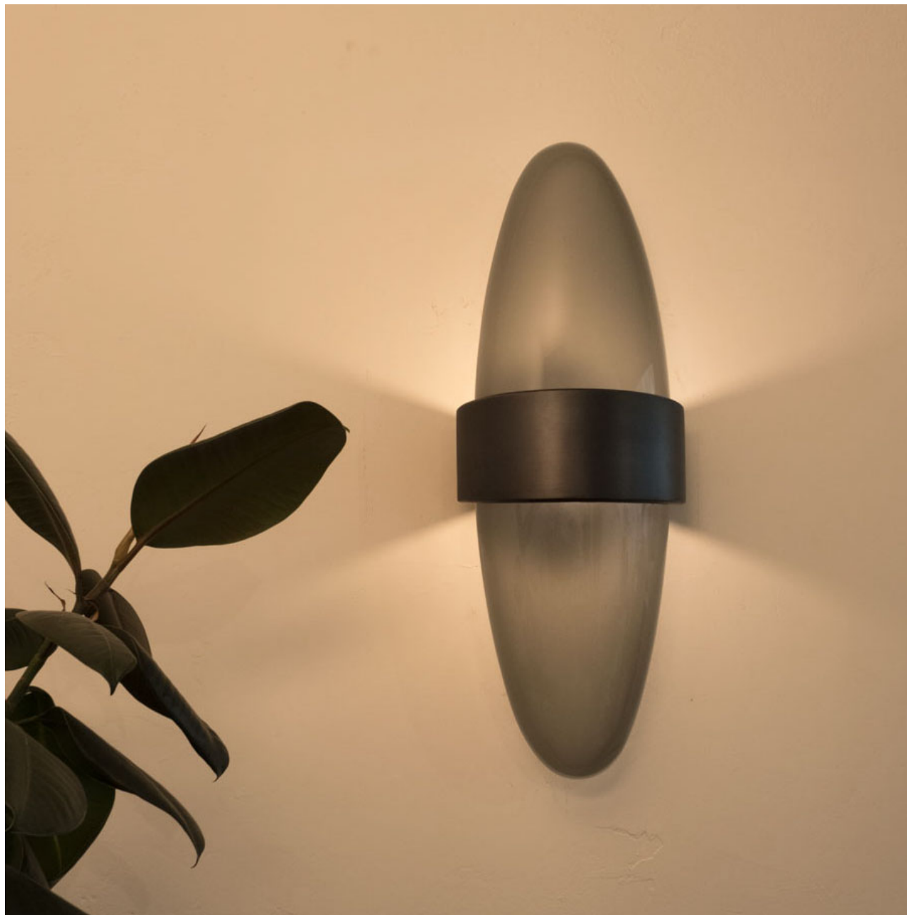
LARGE SOPHIA SCONCE